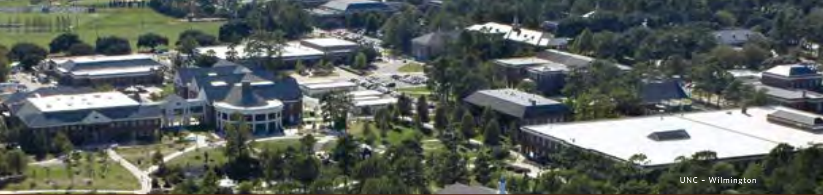
UNC - Wilmington