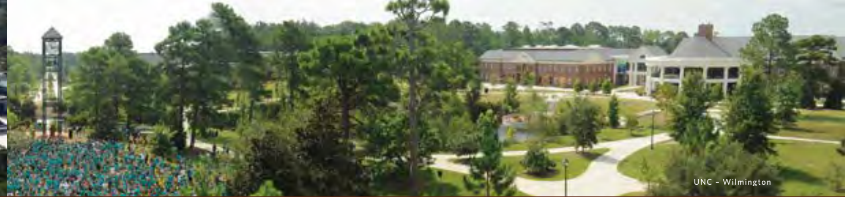
UNC - Wilmington