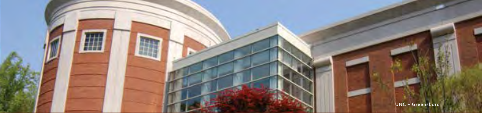
UNC - Greensboro