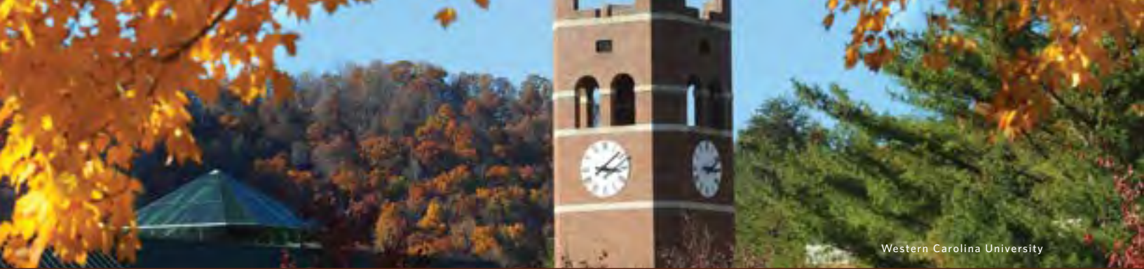
Western Carolina University